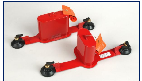
Angle of attack (AOA) covers