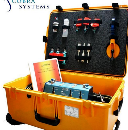
B737 Pitot Static Accessories kit AK737