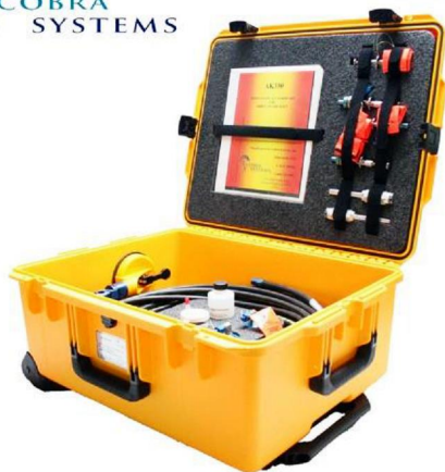
A320 Pitot Static Accessories kit AK320